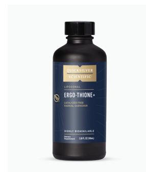
Ergo-Thione+ QTY 2 - 100 mL Bottles