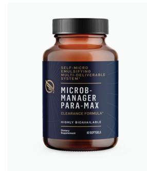
Microb-Manager Para-Max QTY 1 - 60 capsules