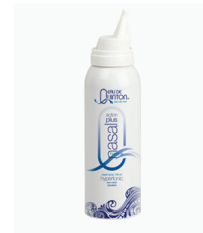
Quinton® Action Plus Nasal Spray QTY 1 - 100 mL Bottle