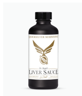
Liver Sauce® QTY 2 - 100 mL Bottles