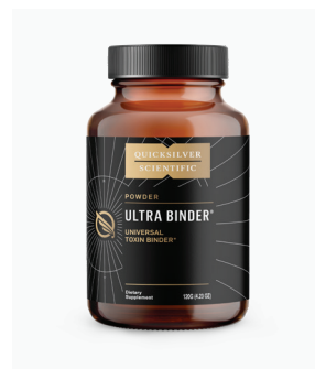
Ultra Binder® Powder QTY 1 - 30- 1 tsp servings