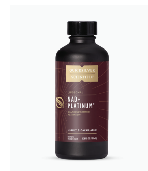
NAD+ Platinum® QTY 2 - 100 mL Bottles