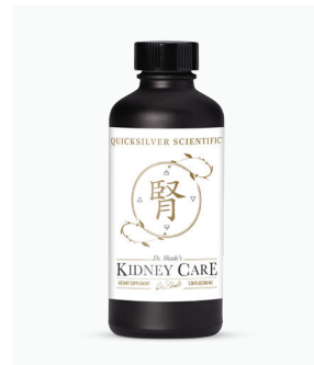
Kidney Care QTY 2 - 100 mL Bottles