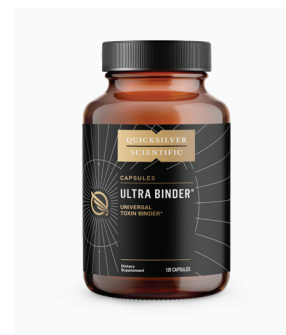
Ultra Binder® Capsules QTY 1 - 120 capsules